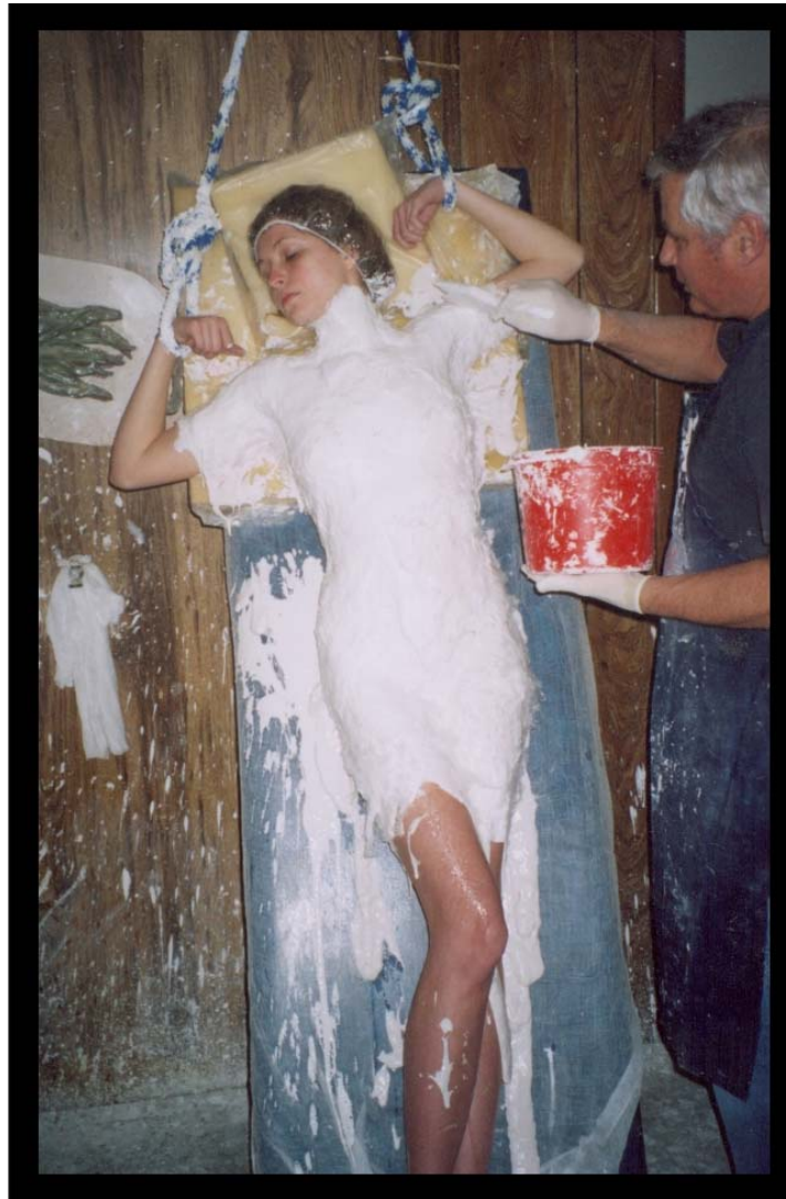
Photographs by Andy Hall

The author painting thin plaster into cotton which is stuck into the alginate of this torso casting.