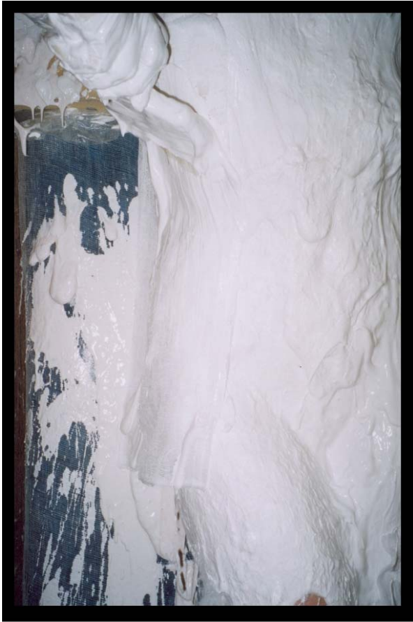
Painting plaster onto a piece of cheesecloth as a substitute for plaster bandages

like plaster will begin to thicken in just a few minutes. Once the plaster becomes too thick to soak through the cheesecloth, adding some water may buy you some time, but not but not much. When casting a torso or larger, I usually have to mix a second batch. If you mix the second batch in the same bucket in which there remains a small amount of the first plaster, the second will setup even more quickly so that mixing additional plaster only adds a few minutes to the process.