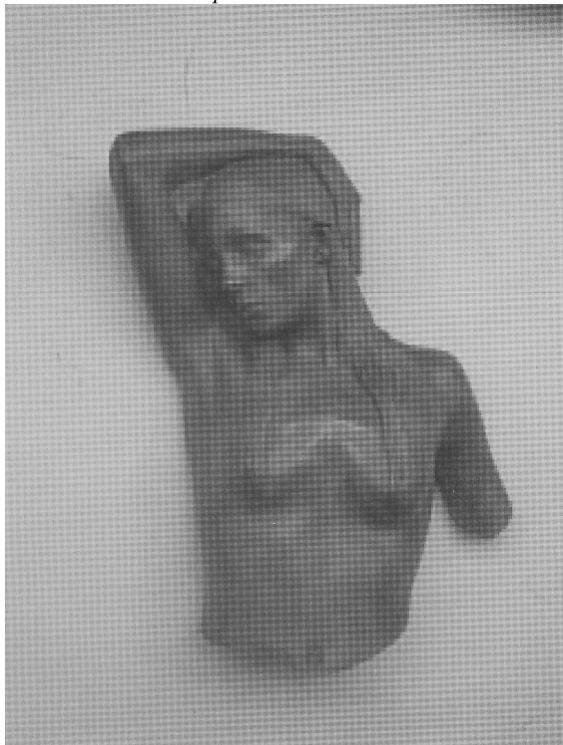
"Nina" the area covered, the complete right arm, and the hair add to the complexity of this moderately difficult portrait casting.

I used to paint on the bonding agent with a brush; now I use a spray bottle. Not only is it much faster, but it will not damage the still liquid alginate as a brush would.